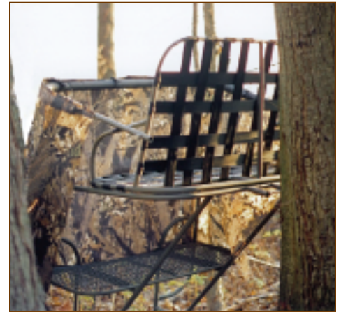
An optional camouflage skirt is available for the Family Tradition Double Ladder Stand. It's a smart addition that will keep you hidden.